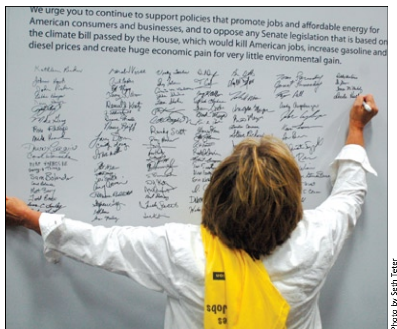
Ohioans signed their names to express opposition to House climate legislation during a rally in Lima last month.