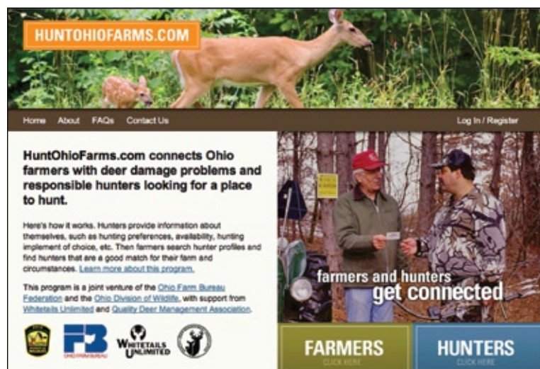
The Web site www.huntohiofarms.com matches farmers and hunters in an effort to reduce the deer population.