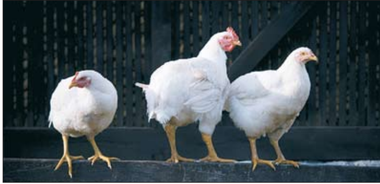
A mobile slaughterhouse could serve Ohio farmers interested in raising poultry on a small scale.

"A lot of what we've been hearing is that people want to grow chickens but they don't have a place to slaughter them. And those who already raise chickens have to travel a couple of hours to process them. A number of people in the poultry industry have been talking about the need for