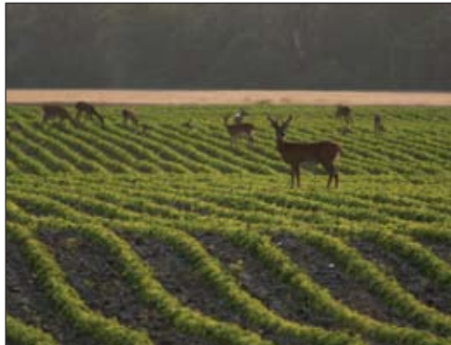
In addition to damage permits, OFBF policy calls for numerous methods to reduce the deer herd.

"The most common complaint on denial that I have heard has been with cover crops or forage. Shooting permits are sometimes denied for safety purposes," Risley said, noting that suburbs often