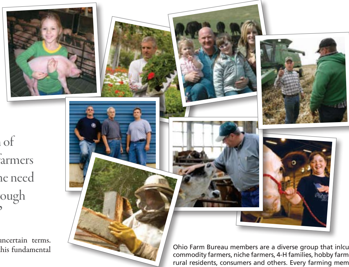
Ohio Farm Bureau members are a diverse group that includes commodity farmers, niche farmers, 4-H families, hobby farmers, rural residents, consumers and others. Every farming member gets one vote on the organization's policies.

This quote from a 1921 publication describes this organization in no uncertain terms. As we reflect on another year of accomplishments, it is appropriate to revisit this fundamental question: Who is Ohio Farm Bureau?