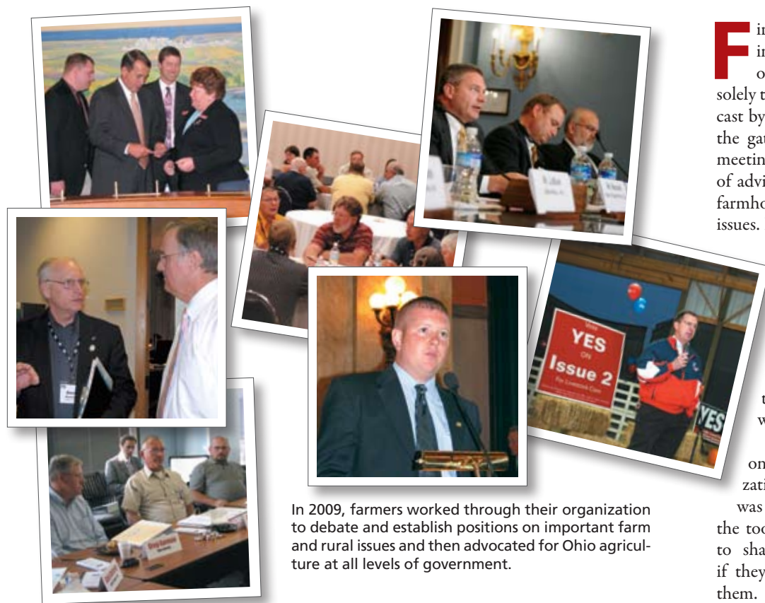
In 2009, farmers worked through their organization to debate and establish positions on important farm and rural issues and then advocated for Ohio agriculture at all levels of government.