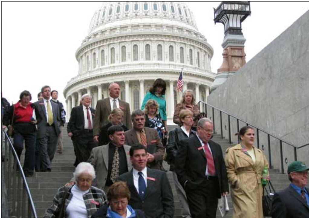
Ohio farmers leave Capitol Hill during an annual trip in which they meet with Washington officials.