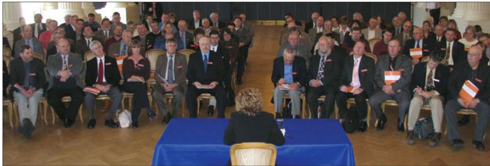
Ohio county Farm Bureau presidents participate in a briefing at the embassy of the Organization of American States.