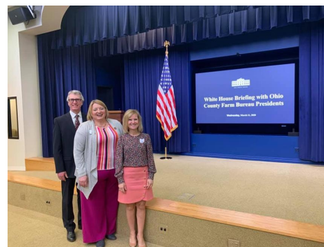
Presidents trip to DC