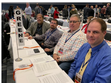
Ohio Farm Bureau Annual Meeting