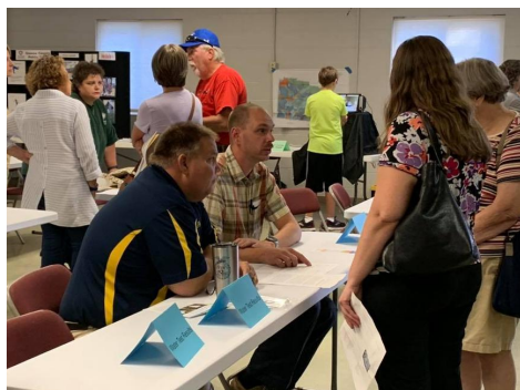
Test Your Well