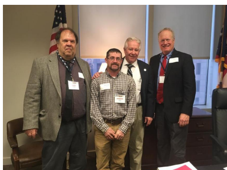
Ag day at the Capital