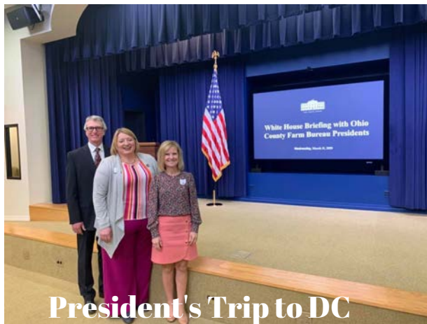
President's Trip to DC