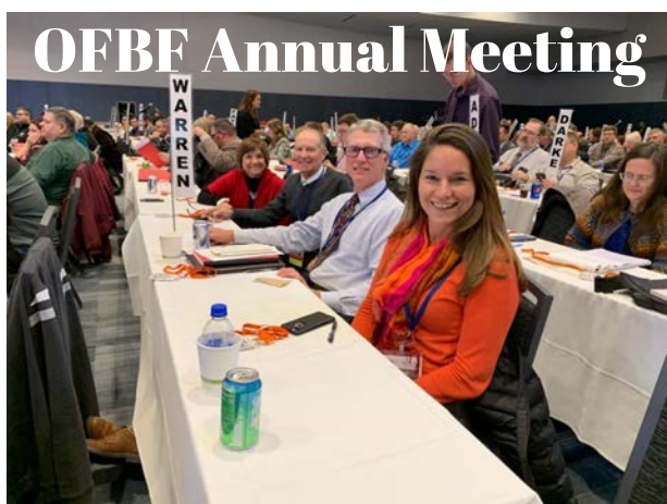
OFBE Annual Meeting