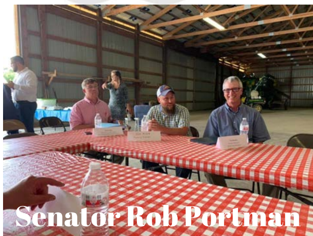
Senator Rob Portman