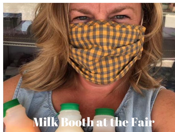
Milk Booth at the Fair