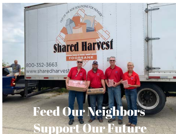
Feed Our Neighbors Support Our Future