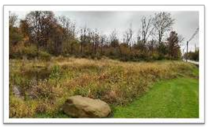
Wetland created to address excess stormwater

10. Are there any stormwater management projects to improve water quality that would be beneficial in this watershed? Examples include public rain gardens, pocket wetlands to treat stormwater flow, permeable pavement, or bioretention. If so, please provide the location and a site description.