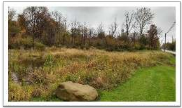
Permeable pavement with bioretention